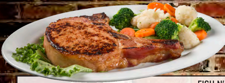
SMOKED PORK CHOP