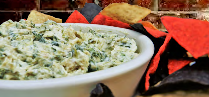
HOMEMADE SPINACH ARTICHOKE DIP